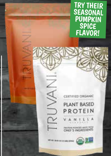
TRUVANI PLANT PROTEIN

TRY THEIR SEASONAL PUMPKIN SPICE FLAVOR!