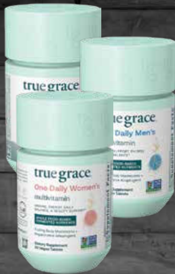
TRUE GRACE ENTIRE LINE

OVER 200 ITEMS BOGO 50% OFF MIX 'N MATCH! COME IN TO SEE THEM ALL!