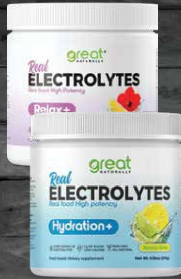
GREAT NATURALLY ENTIRE LINE