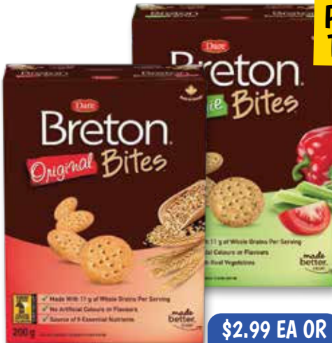
BRETON MINI CRACKERS 8 OZ MULTIPLE FLAVORS