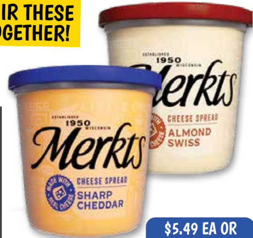
MERKTS CHEESE SPREAD 12.9 OZ MULTIPLE FLAVORS