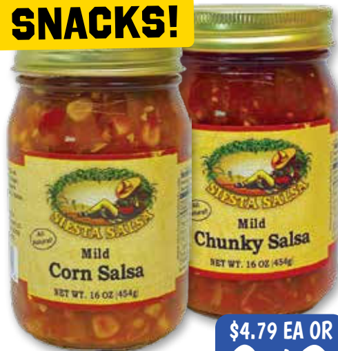
SIESTA SALSA SALSA 16-17 OZ MULTIPLE FLAVORS