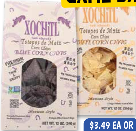
XOCHITL CORN CHIPS 12 OZ MULTIPLE FLAVORS