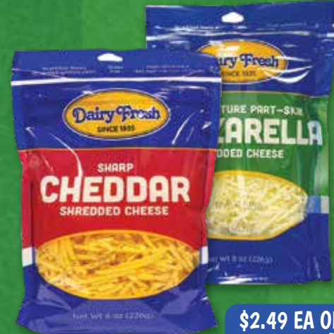
DAIRY FRESH SHREDDED CHEESE 8 OZ MULTIPLE FLAVORS