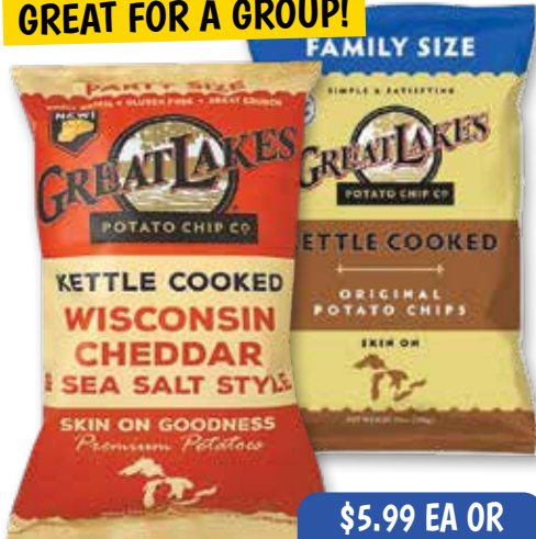
GREAT LAKES KETTLE CHIPS 14 OZ MULTIPLE FLAVORS