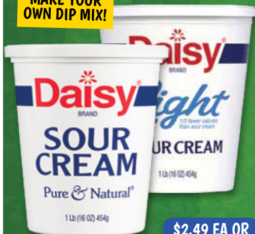
DAISY SOUR CREAM 16 OZ