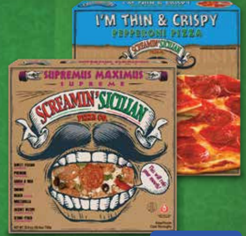
SCREAMIN' SICILIAN PIZZA 16.35-25 OZ MULTIPLE FLAVORS EXCLUDES DETROIT