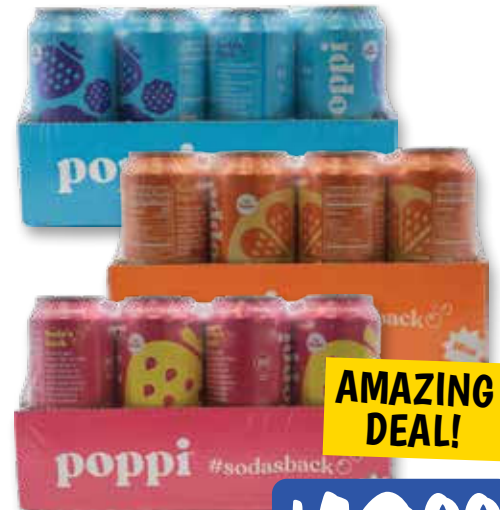
POPPI PREBIOTIC SODA 12 PK 16 OZ MULTIPLE FLAVORS